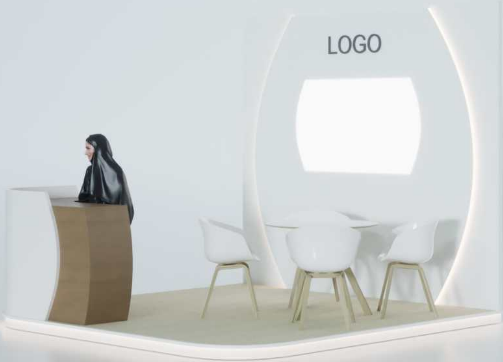
Sample booth design

DRIVING SUSTAINABLE ECONOMIC GROWTH AND INNOVATION WORLDWIDE