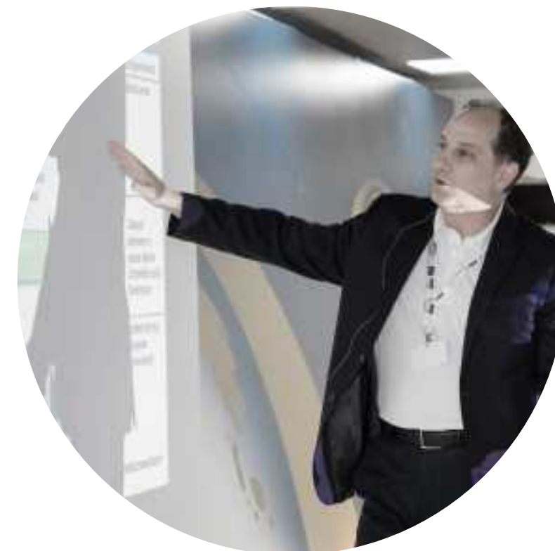
KNOWLEDGE SHARING AND RESEARCH