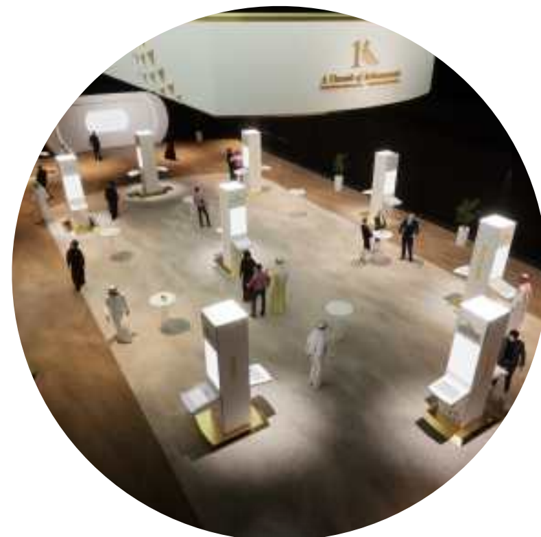
EXTENSIVE EXHIBITION AREA