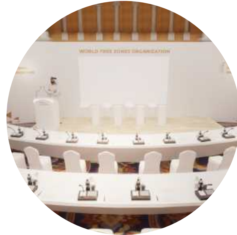
NEW INTERACTIVE PANEL DISCUSSIONS