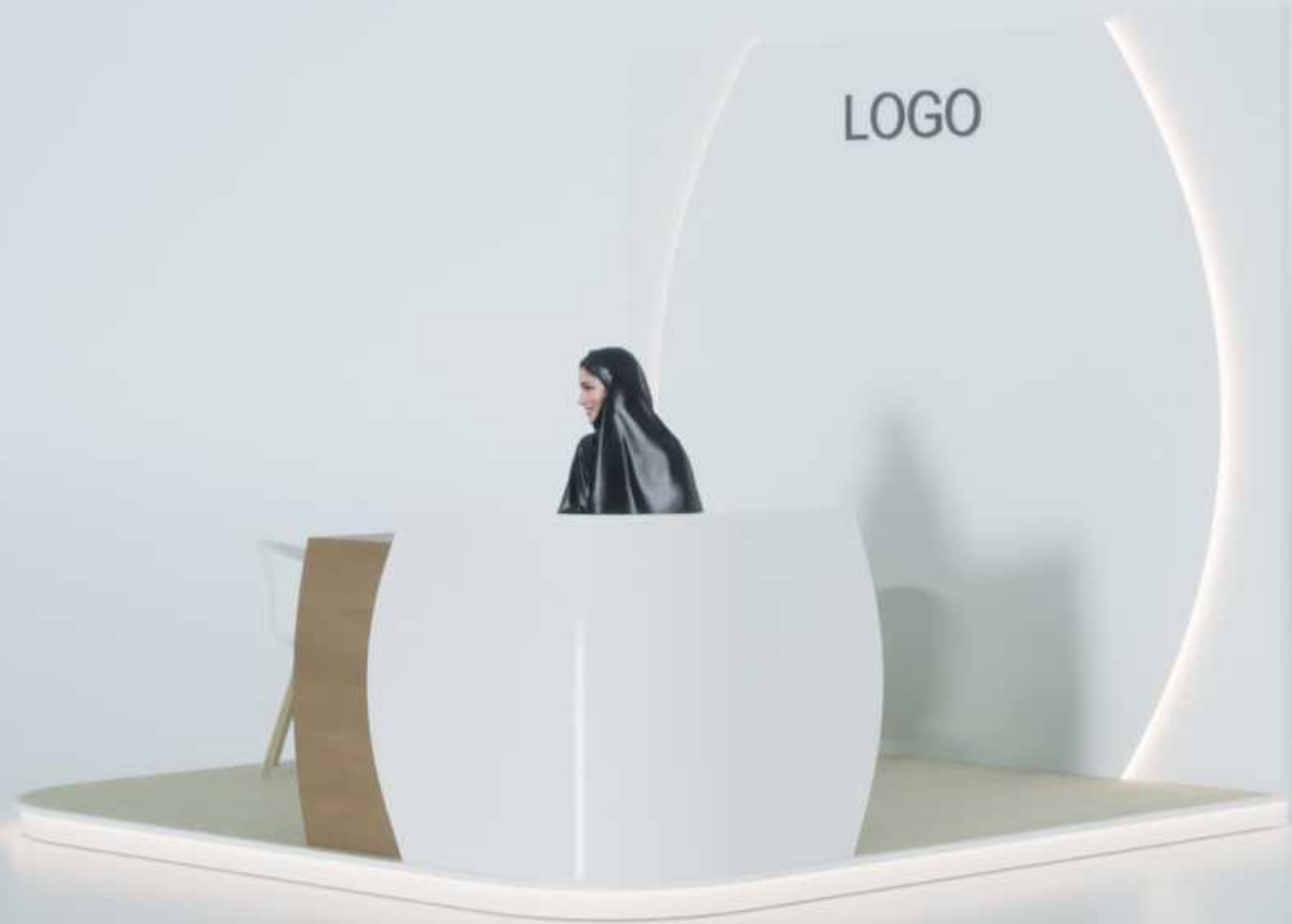
Sample booth design

DRIVING SUSTAINABLE ECONOMIC GROWTH AND INNOVATION WORLDWIDE