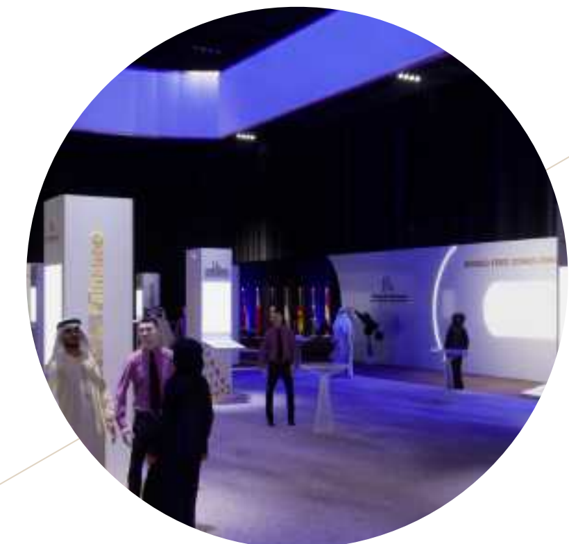
EXCLUSIVE SOCIAL EVENTS